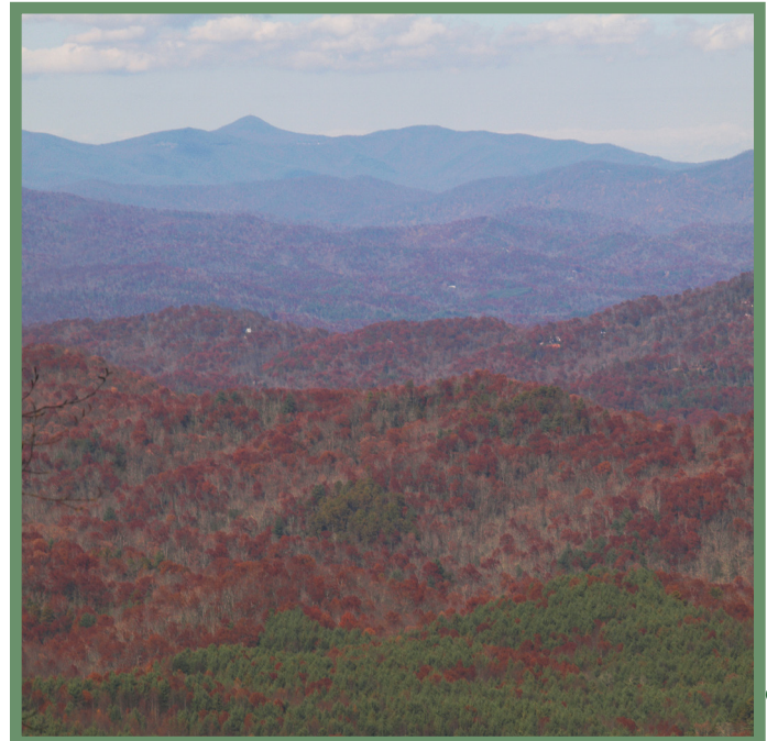
View from Sassafras Mtn. toward Mt. Pisgah

A project of this magnitude and importance can’t be forever protected without your help.